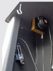
Height Limit Switch and Displacement Sensor