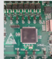
Intelligent Control System