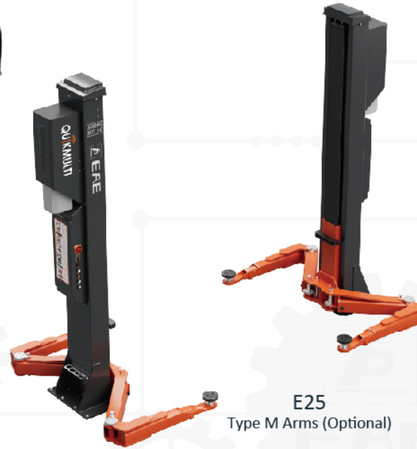
E25 Type M Arms (Optional)