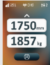
HMI Screen (Optional weight indicator)